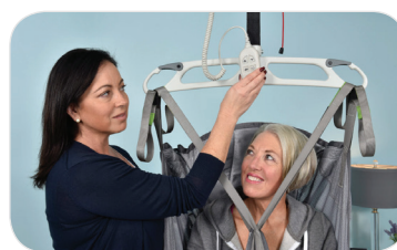
Magnetic Controller Store

Product Specifications Monarch Fixed Hoist