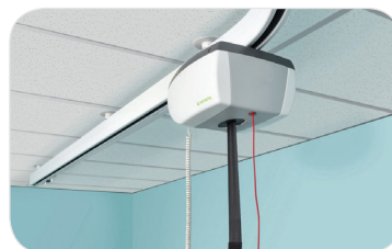
Low lift clearance