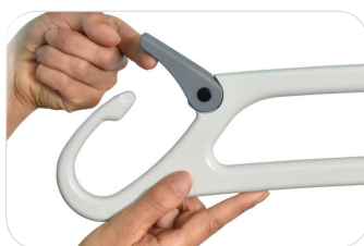
Secure Sling Mechanism